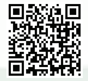
Holistic Music School